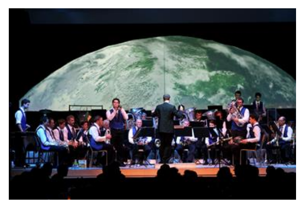
Brass Band MG Oberrüti

Saturday, 10<sup>th</sup> - Opening Ceremony at Huaihai Road Sunday, 11<sup>th</sup> - Huajing Park (15:00 - 15:30) Monday 12<sup>th</sup> - Oriental Pearl TV Tower (16:30 - 17:00) Tuesday, 13<sup>th</sup> - Nanjing Pedestrian Street (15:00 - 15:30)